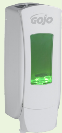
Customize your ADX dispenser with your company logo.