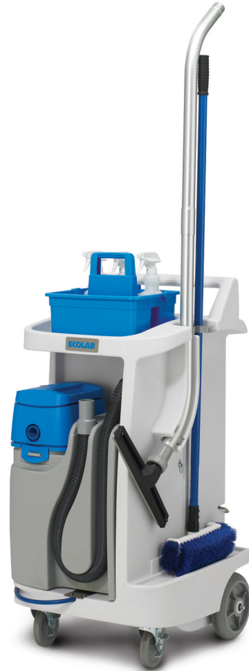
Ecolab Cleaning Caddy shown here with on board Wet Vac.

The Cleaning Caddy comes equipped with either a wet vacuum or a storage shelf. Regardless of which option you choose, each unit contains a professional window squeegee, hand caddy, doorstops, dual surface deck brush, and charger.