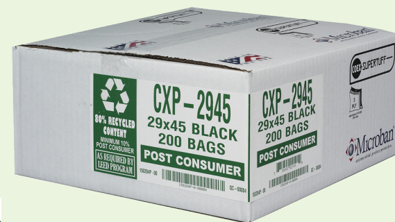
Obtain points towards your LEED certification.