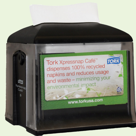
Xpressnap Café dispensers available in red, green, black, and granite.